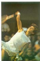
The Website of Maria Bueno, Tennis Champion